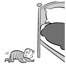
1 jump / crawl under the bed