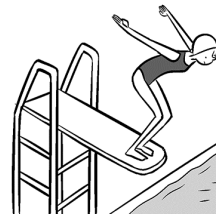
2 dive / climb into the swimming pool