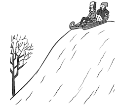
3 fall / slide down the hill